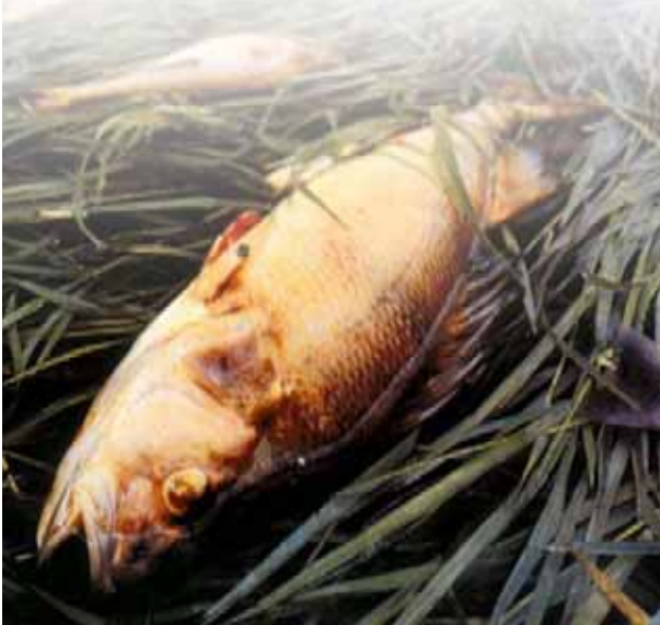
Acidification damages entire freshwater ecosystems by killing fish and upsetting the food chain

Lakes polluted by acid rain can support only the hardiest species. Acidification damages entire freshwater ecosystems by killing fish and upsetting the food web within the system. When fish die this removes the main food for birds. Birds can also die from eating toxic fish and insects, and fish can die from eating toxic animals too. Acid rain can even kill fish before they are born.