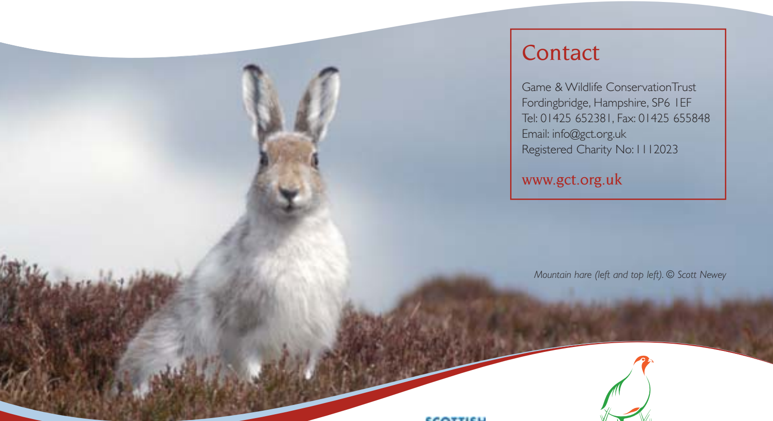
Mountain hare (left and top left).