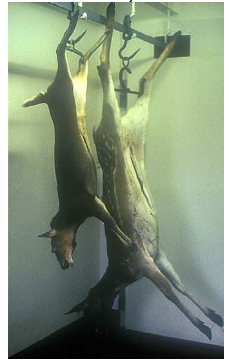
Fallow and muntjac carcasses

In Scotland, most of the deer range is under the management of sporting estates where the number of venison carcasses produced is driven by other sporting management objectives because income from stalking is substantially greater than income from venison. Early indications from England suggest that stalker and recreational hunters view venison income as an important component of the economics of hunting and will respond if prices increase. A paper in draft discusses the extent this is to do with differing cultural patterns relating to hunting traditions between the two countries